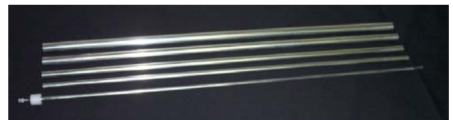
Set of aluminum tubes used in NEMA PET Sensitivity Phantom™