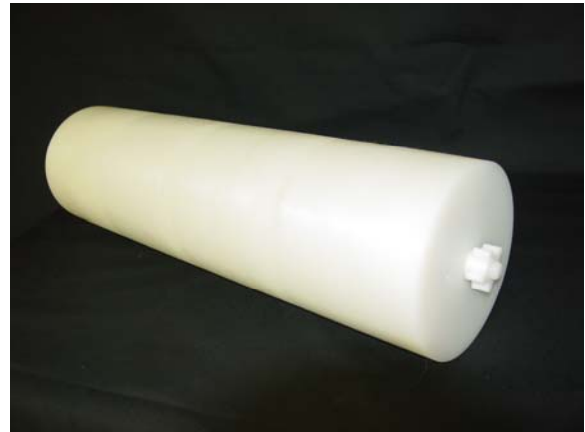
NEMA PET Scatter Phantom™