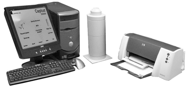
Captus® 3000 Well Counting System