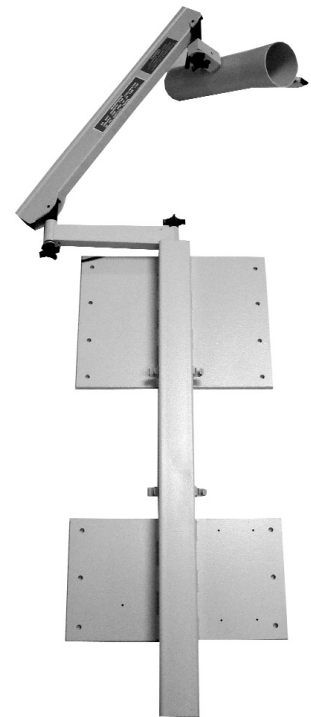
Captus® 3000 Wall Mount