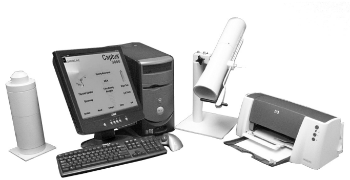
Captus® 3000 Table Top System with well

If one of these variations of the Captus 3000 doesn't meet your needs let us know and we will work with you in creating the most user-friendly and cost effective system for your department.